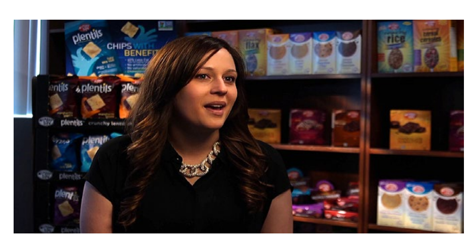
Interviews, executive messages and internal marketing and training