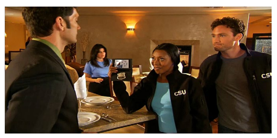
Creative content and live action shoots for a variety of projects